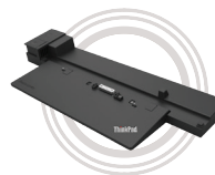
ThinkPad® Performance Dock PN: 40A50230XX