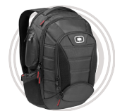
Ogio Bandit 17" Backpack (Black) PN: 111074.03