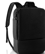
Dell Pro Hybrid Briefcase Backpack 15 - PO1521HB

Multiport adapter with integrated speakerphone offers an all-in-one connectivity and conferencing solution.