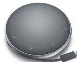
Dell Mobile Adapter Speakerphone - MH3021P

Collaborate with ease anywhere with this Teams certified wireless headset which offers active noise cancellation and smart sensors that automatically mute and unmute your call.