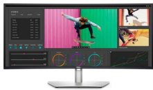
Dell UltraSharp 34 Curved USB-C Hub Monitor - U3421WE

Get immersive productivity on a 34" WQHD curved monitor with a wide color coverage and extensive connectivity including RJ45, USB-C and quick-access front ports.